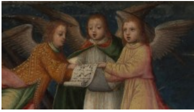
Marcellus Coffermans, Adoration of the Shepherds