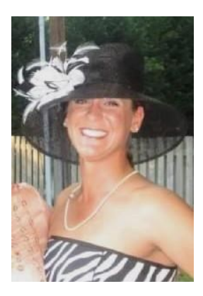
Tuesday, August 22, 2023 at Eleven O' Clock in the Morning St. John's Church in Savannah

Please stand for the entrance of the clergy.