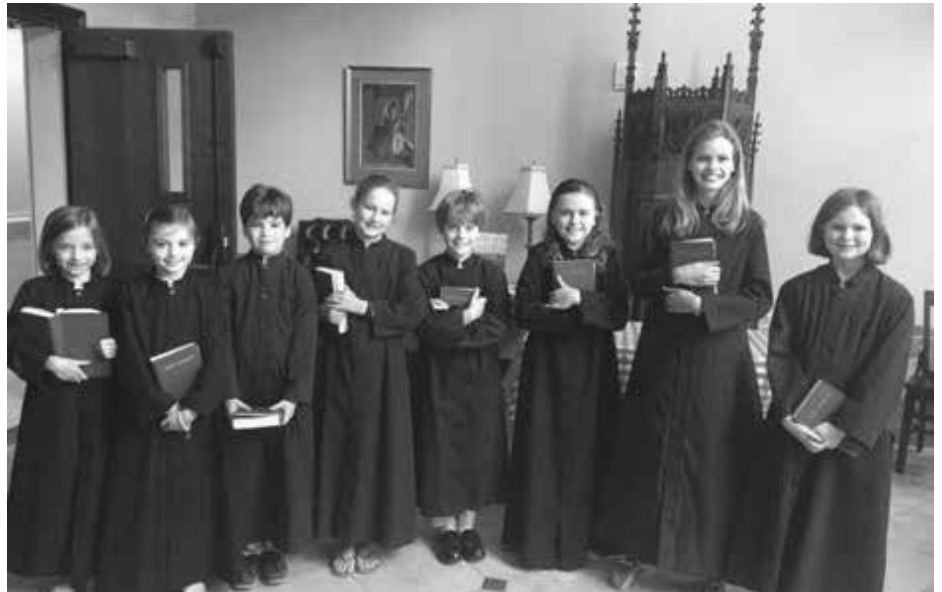
Psalm Psingers gather at Cranmer Hall