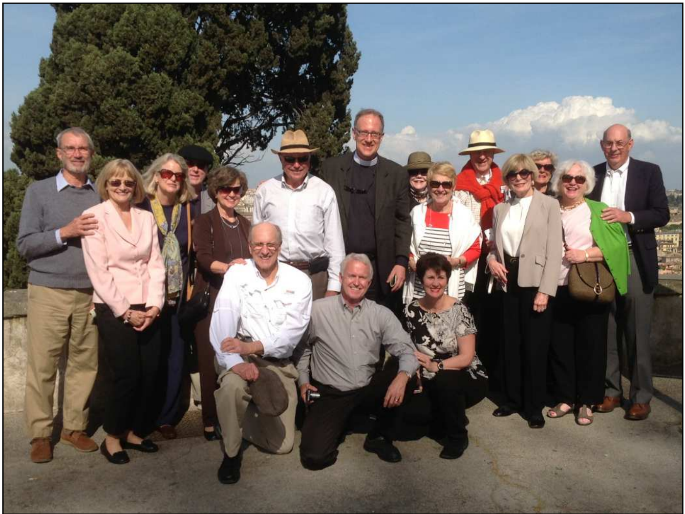
Pictured: St John's Rome Travelers