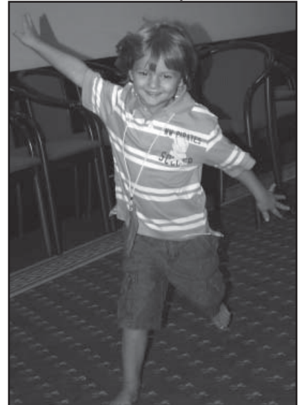
Above: one of our many VBS participants soars like Lofty the Eagle during game time.

As always we have a long way to go, but I am so thankful we have begun this foundation so as they get older and the questions get harder, the question will not be if they have faith, it will be how their faith will guide them. So with that being said, I hope that you will all consider making the commitment to come to church every Sunday, for your children, and for your family because we all know we can use all the help we can get. See you Sunday!