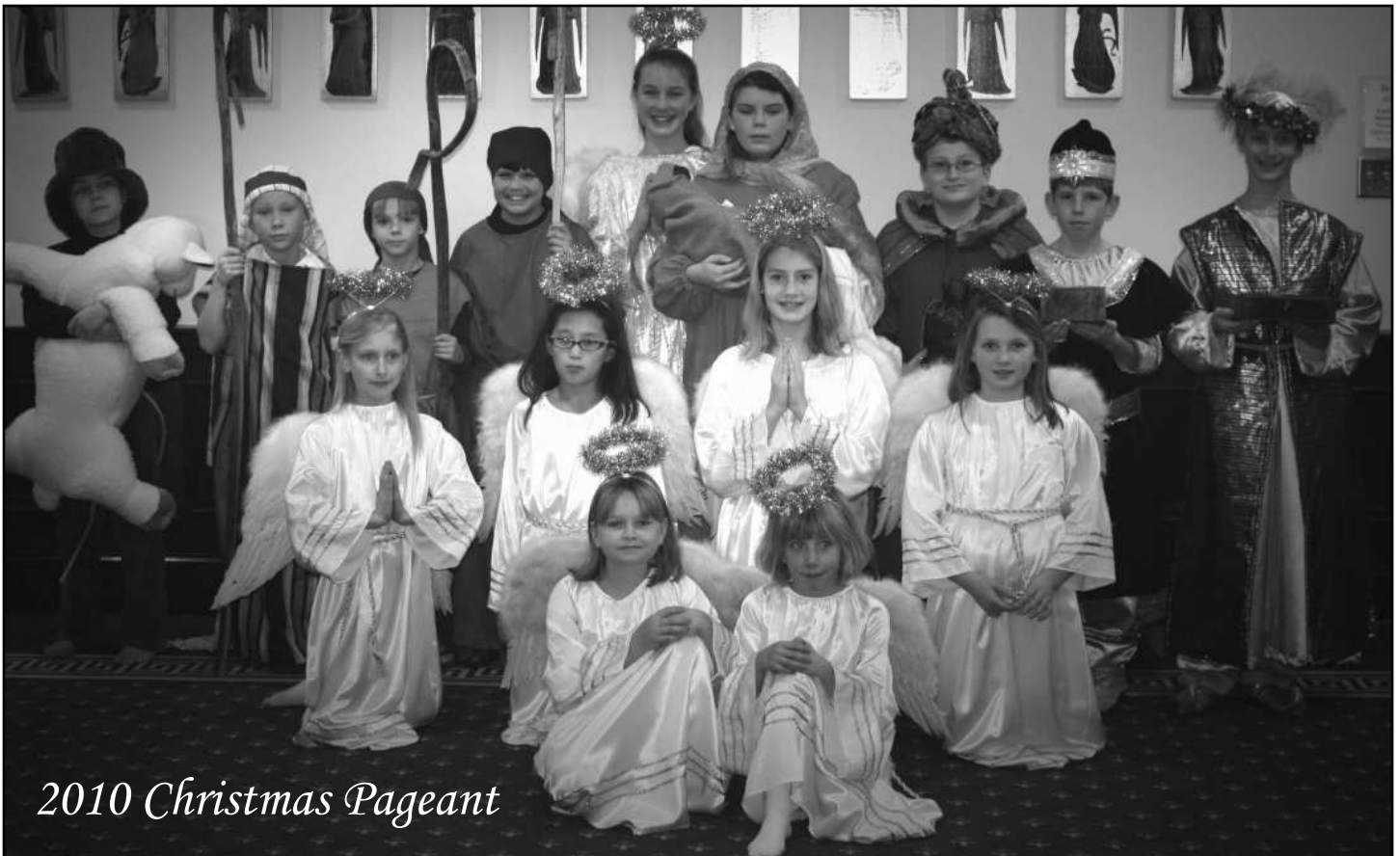
2010 Christmas Pageant