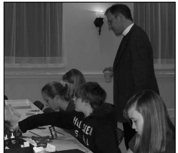
St. John's Youth Creating Valentines for the "Shut-ins"

We pray that all Confirmed youth at St. John's will avail themselves of the upcoming opportunities to grow in our fellowship in Christ through serving, worshiping, and playing together!